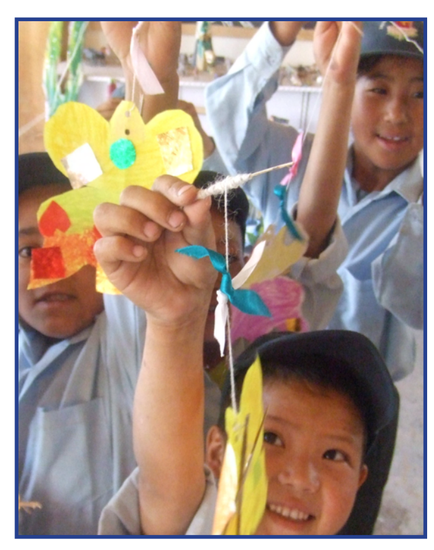
Making kites at White Lotus School

The film viewing was a particular highlight of the whole trip, just for the reaction from the children at seeing themselves on a large screen.